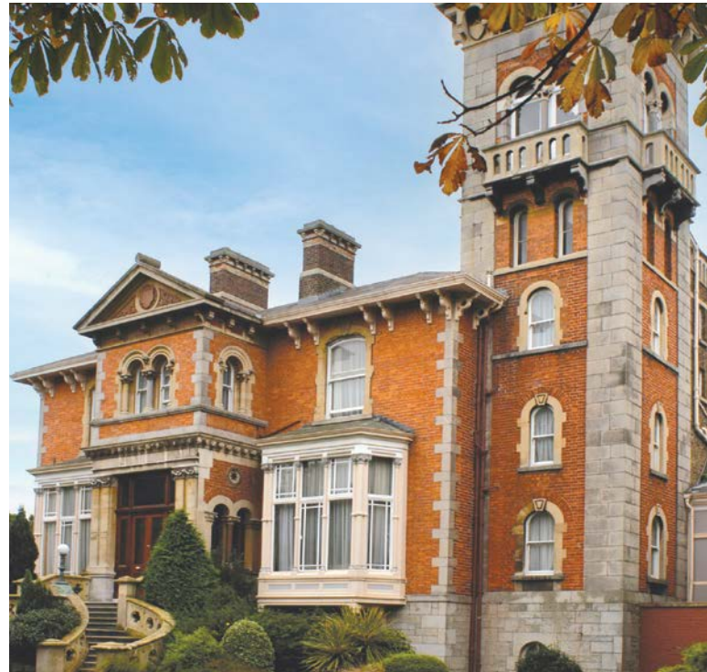
St. Michael's House

All policies and procedures (fire safety, student conduct, drug, alcohol, weapons, sexual violence, relationship violence, missing student, etc.) of the Main campus of Duquesne University apply to the Dublin Campus and students of both campuses are held to the same high standards of conduct and expectations.