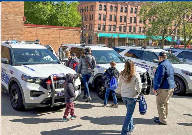
Take your child to work day

A. The Office of Human Resources will be responsible for advising all new employees during their orientation of the University policy concerning the maintenance of a drug-free