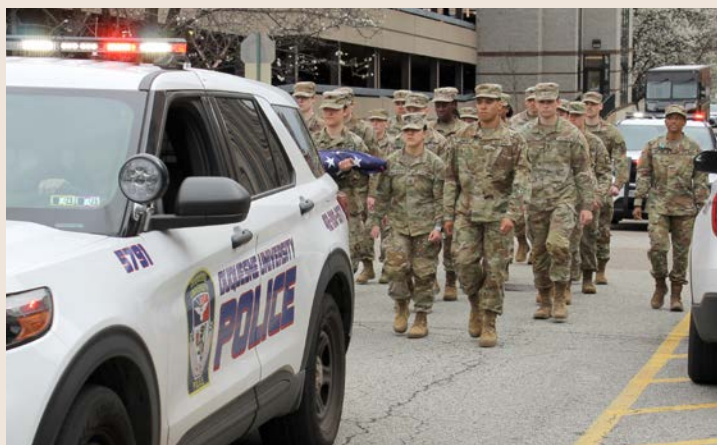
Duquesne University Police and ROTC march

The Department of Public Safety maintains a log of all criminal incidents reported to the department. The daily crime log includes the date and time the report was received, the date and time the incident occurred, the nature of the offense, the location of the offense and the disposition if available. The daily crime log is available for public inspection at the Department of Public Safety.