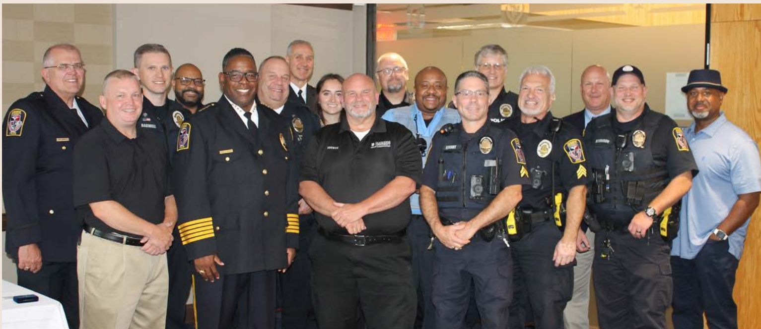
DUPS awards ceremony

Pennsylvania law allows for the controlled use of medical marijuana in the Commonwealth. The University, however, is subject to the federal Controlled Substances Act. Marijuana is classified as a Schedule I drug according to the Controlled Substances Act. Therefore, the purpose of this Policy is to summarize the University’s response to the permissible use of medical marijuana in the Commonwealth of Pennsylvania in the context of the University’s other legal obligations.