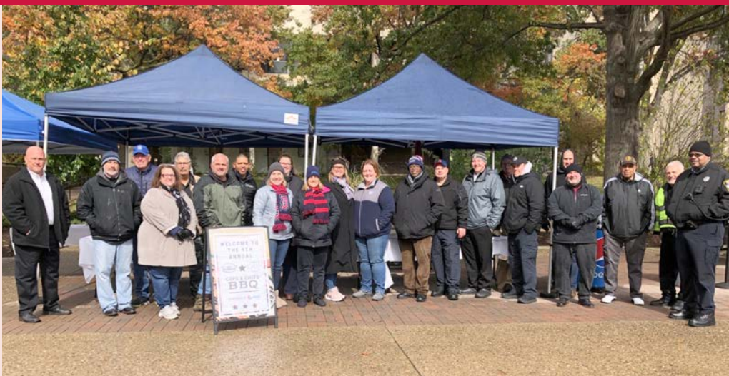
9th Annual Cops & Chefs Cookout benefiting the United Way

The following are free* program topics offered through Public Safety open to both students and employees: