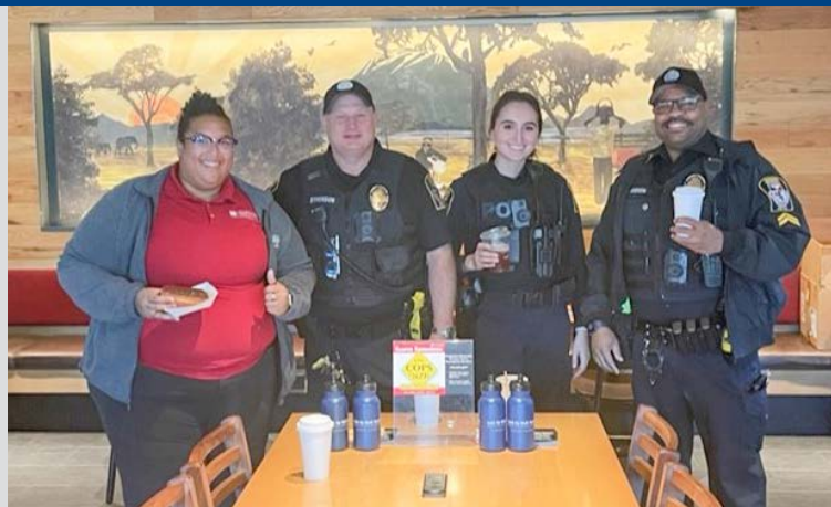
Coffee with a Cop