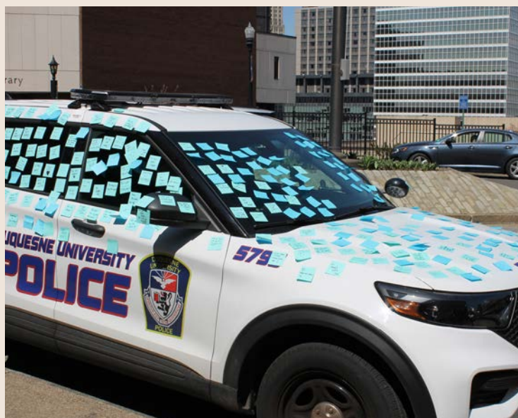
Cover the Cruiser event

e. Responsible Employees – At Duquesne, all employees are Responsible Employees, except for those who are deemed “Confidential Resources” in this Policy.