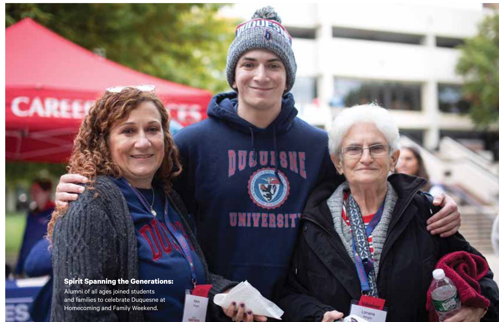
Spirit Spanning the Generations: Alumni of all ages joined students and families to celebrate Duquesne at Homecoming and Family Weekend.

➔ Check out www.myduquesne.duq.edu/events for more information on upcoming virtual and in-person events that will be scheduled. Alumni also can visit duq.edu/alumni for the latest details on what's happening at Duquesne, events and how to get involved and stay connected.