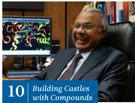
10 | Building Castles with Compounds