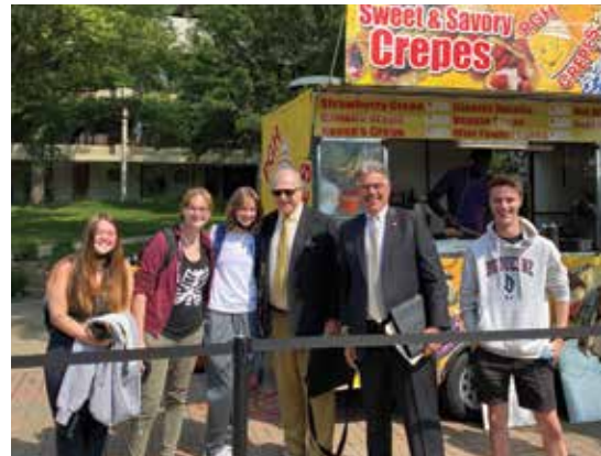
Food Truck Friday came back to the Bluff this fall.

It is imperative to critically evaluate these decisions by the court to understand their impact on both the individual and society as a whole.