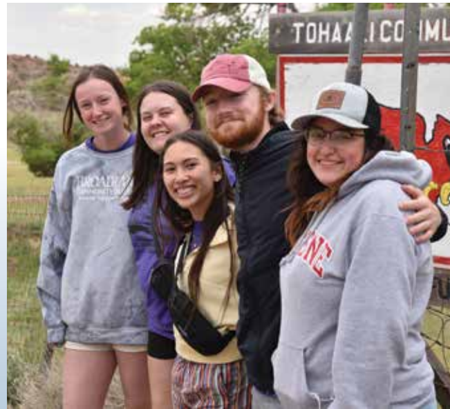
The Duquesne group takes a moment to enjoy the scenery.