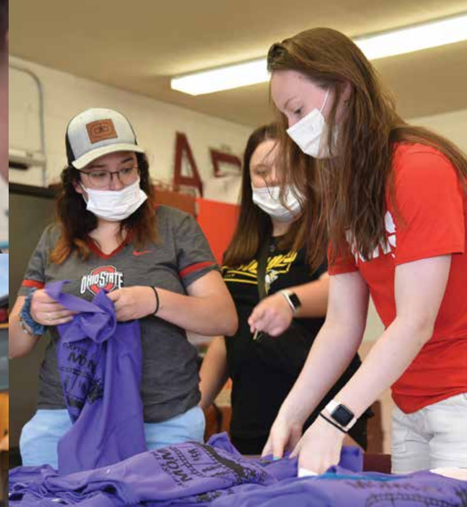
The Duquesne group helps to organize supplies for Field Day, an annual school event that features games and activities for the entire student population.