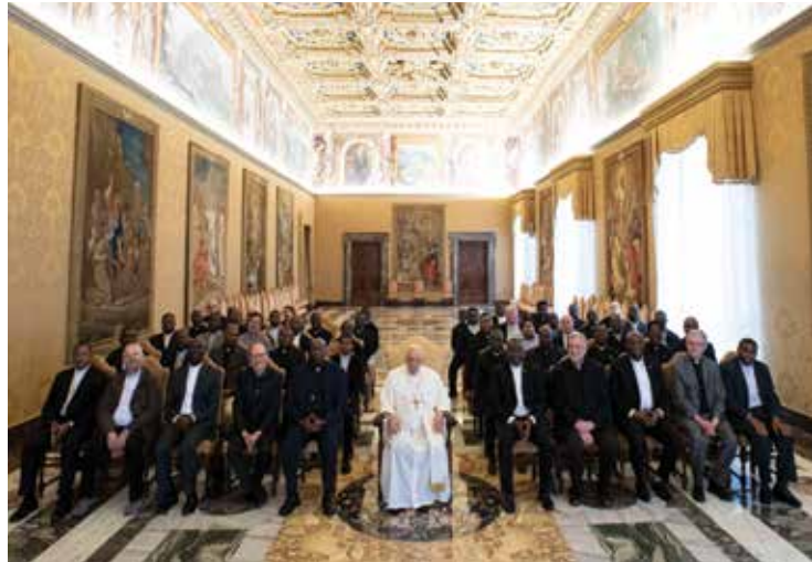
On May 8, 2023, Pope Francis received and gave his apostolic blessing to the 49 members representing the 2,600 members of the Spiritan community worldwide to commemorate the 175th anniversary of the fusion of the Congregation in 1848.

FROM FESTIVE CAMPUS EVENTS TO NEWSWORTHY HAPPENINGS, THE DUQUESNE SPIRIT BRINGS PEOPLE TOGETHER.