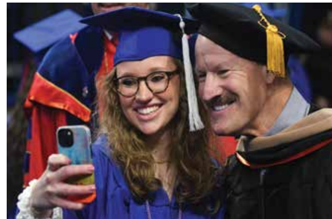
Former Steelers coach Bill Cowher was the commencement speaker for McAnulty College and Graduate School of Liberal Arts.

We want to create a delivery system that safely and effectively delivers healthy mitochondria to repair damaged cells.