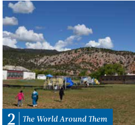
2 | The World Around Them