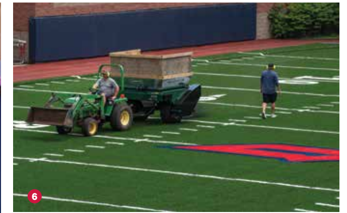
1, 3 - The new 11-story, 556-bed student apartment building on Forbes Avenue will feature amenity spaces, bicycle parking, a fitness area and outdoor courtyards. 2 - The College of Medicine is nearly complete and almost ready to welcome its inaugural class in 2024. 4 - The University Wellbeing Center has been relocated to its own new dedicated space on the third floor of Gumberg Library and just off Brottier Commons. 5 - The Duquesne Union atrium face lift features updated transparent railing panels, a welcoming wide digital display and selfie-worthy wall graphics. 6 - Used by club sports, intramurals and student "3 on 3 pick-up" games during study breaks, McCloskey field has received new synthetic turf and updated Athletic branding.