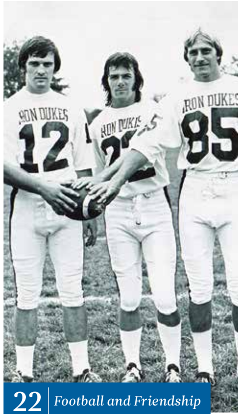
22 | Football and Friendship