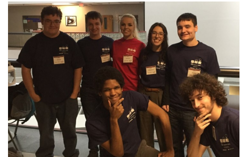
CS Club members at the 2018 ACM ICPC Regionals in Youngstown