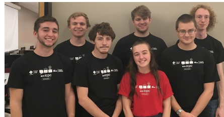
CS Club members at the 2017 ACM ICPC Regionals in Youngstown.

As Computer Science enthusiasts, we try to expand our knowledge and challenge ourselves by participating in hackathons and competitions throughout the year. (Please see the "Competitions" panel for a list of upcoming events.) Last spring, we hosted our own hackathon for the first time for Duquesne students and will be doing so again this year. Additionally, we occasionally hold workshop meetings which typically involve a recent Duquesne Computer Science graduate returning to give a presentation. This year, we are looking to expand our collection of activities to include a collaborative programming project.