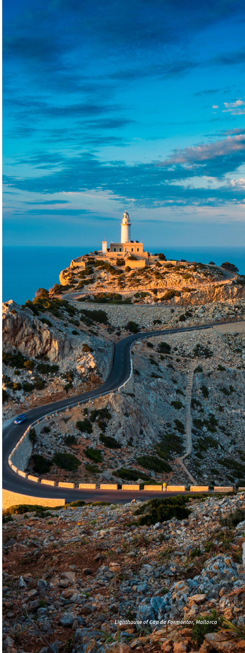
Lighthouse of Cap de Formentor, Mallorca