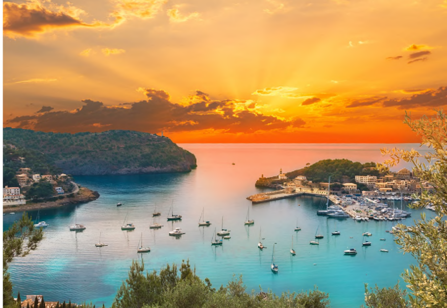
Top left: Total Solar Eclipse Phases Bottom left: Palma de Mallorca Right: Port de Sóller

This morning, we depart for Valldemossa, a village steeped in old-world charm, nestled in an idyllic valley amid the Tramuntana mountains. Its ancient blonde stone houses contrast vividly with the surrounding green forests of olive, oak, and almond trees, and the blue sky above. In the early evening, embark on a cruise from the Port de Sóller. Aboard our vessel just before sunset, we'll experience a breathtaking solar eclipse. Totality will last for 94 seconds, beginning at 8:31:32 p.m., with the sun positioned 21\frac{1}{2}^\circ above the horizon. Sunset (8:50 p.m.) will occur with a partial eclipse in progress. We will partake in a celebratory eclipse group dinner thereafter. INNSIDE PALMA BOSQUE HOTEL (B, L, D)