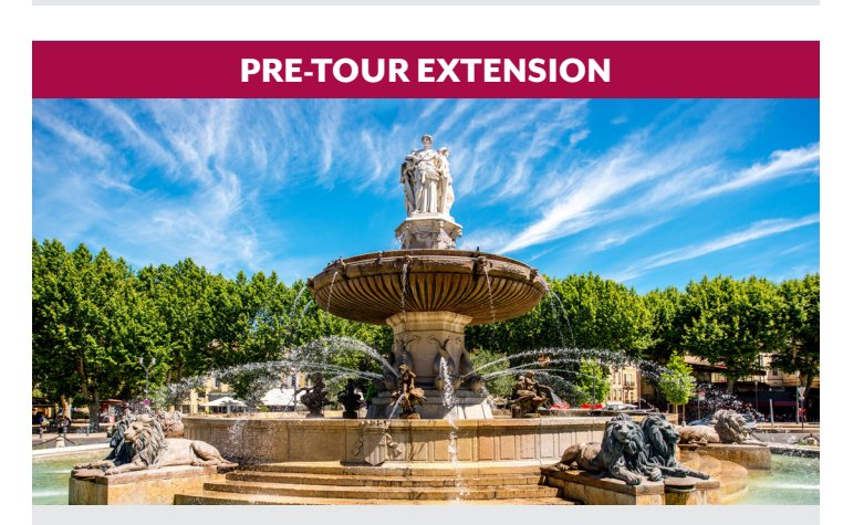
Aix-en-Provence, France | 4 days, 3 nights September 4 to 7, 2025 | Program Begins: September 5