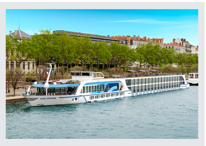
Viva Voyage Exclusively Chartered, River Boat