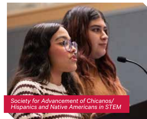
Society for Advancement of Chicanos/ Hispanics and Native Americans in STEM