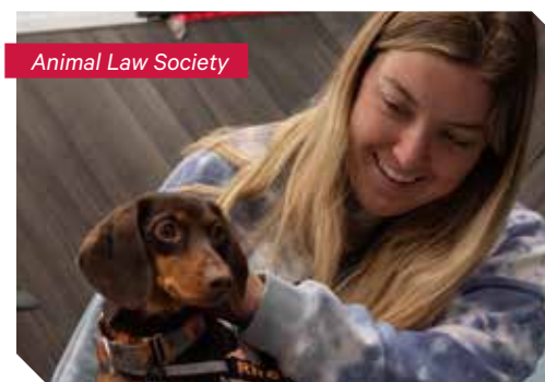
Animal Law Society