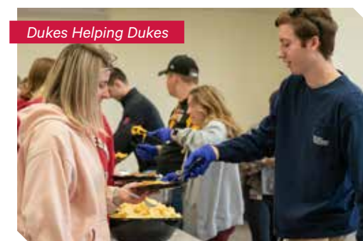
Dukes Helping Dukes