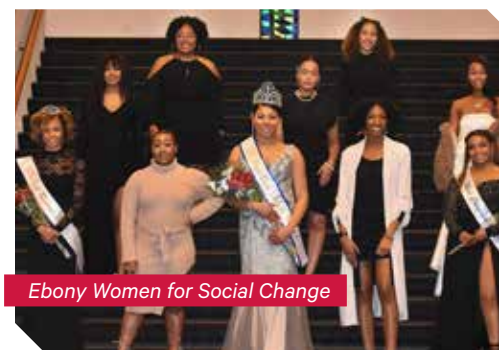
Ebony Women for Social Change