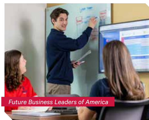
Future Business Leaders of America